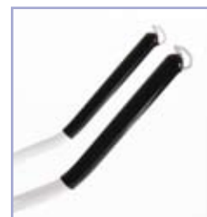
Cow horn handles ensure a safe and stable transfer