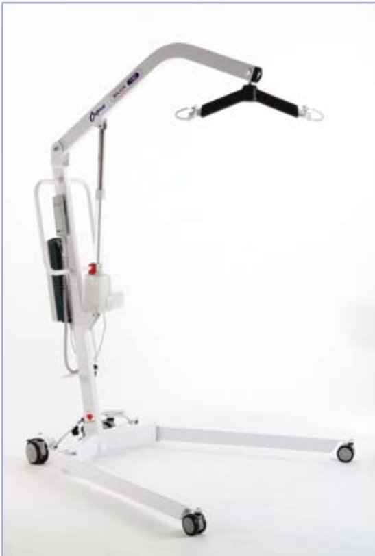
Major 190 (190 kgs SWL)