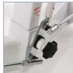
Leg opening device