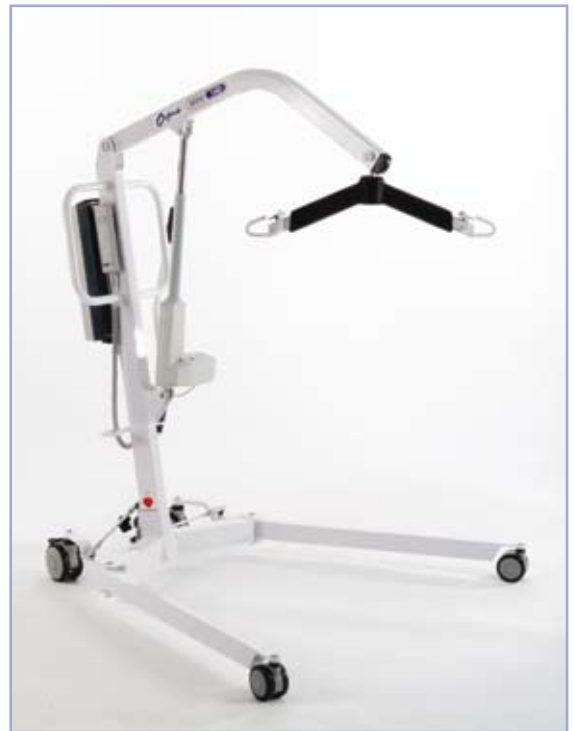
Mini 140 (140 kgs SWL)

The Mini and Stowaway are available in both electric and hydraulic versions.