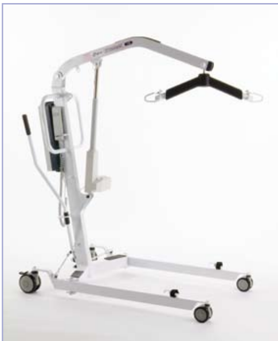
Stowaway 140 (140 kgs SWL)