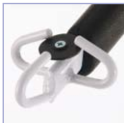
Sling attachment point