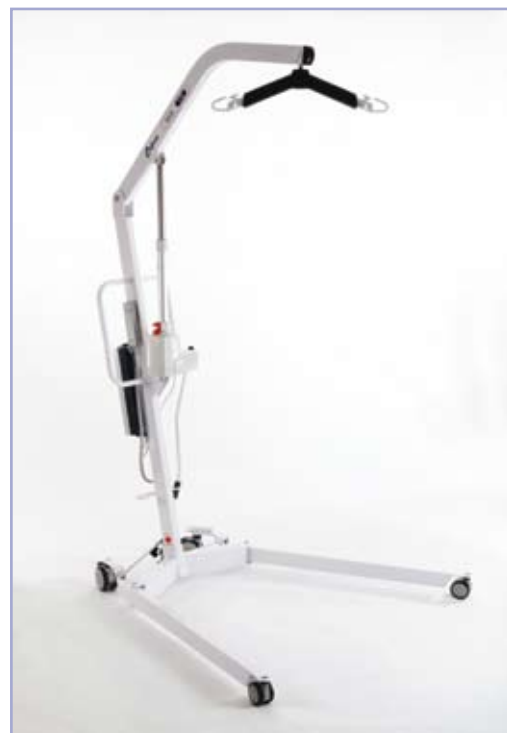
Maxi 170 (170 kgs SWL)

The Standaid also provides an extremely secure and comfortable lift for those patients who have the upper body strength to participate. This is primarily due to the natural sitting position achieved by the lift mechanism and sling.