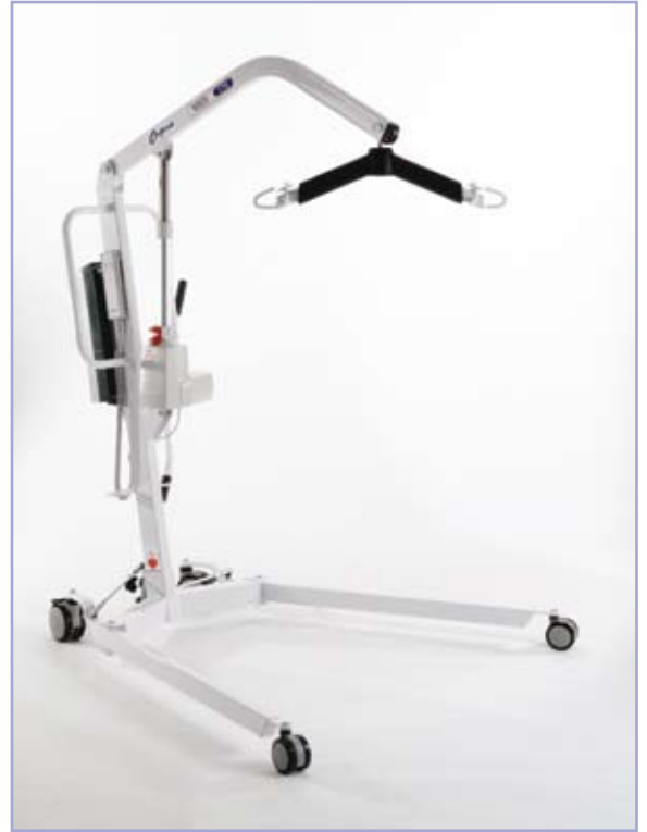
Midi 170 (170 kgs SWL)

The Oxford Midi 170 has become the versatile industry standard in homecare, offering surprising performance for a hoist of its size. The Oxford Midi offers the perfect solution for the community/nursing environment, whilst being sympathetic to the space constraints it may encounter. Available in both electric and hydraulic versions, the Midi is the all-round performer.