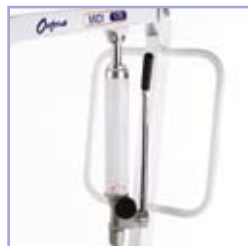
Hydraulic pump used on non-electric hoists