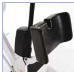
Large knee pad for added support