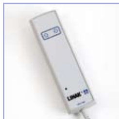
Easy to use hand control