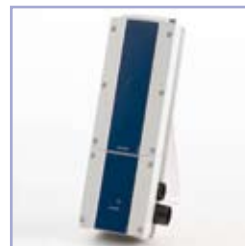
Off-board desktop charger