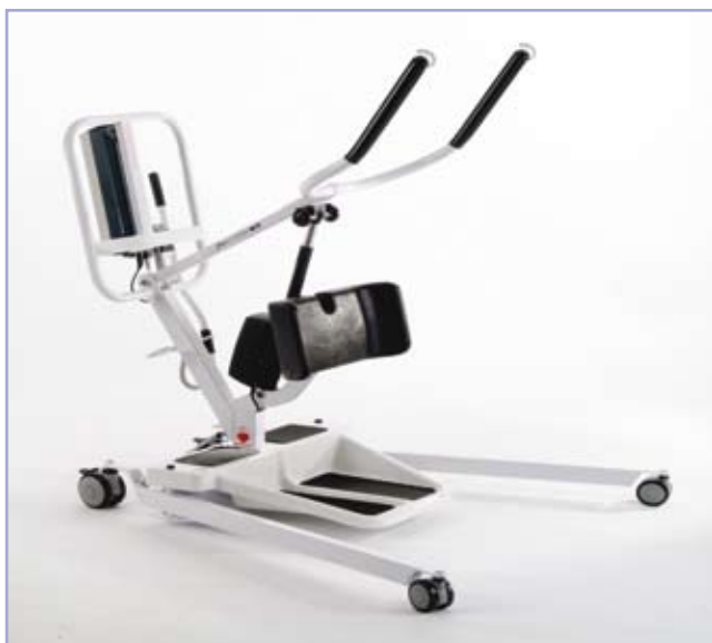
Standaid 140 (140 kgs SWL)

The Oxford Maxi 170 is exceptionally versatile and with a maximum lift height from the floor of almost 2 metres, the Maxi can handle almost any patient handling task. The Maxi can lift patients onto almost all institutional and nursing surfaces. Remarkably, the Maxi maintains a relatively compact frame allowing the hoist to be manoeuvred and stored with ease.