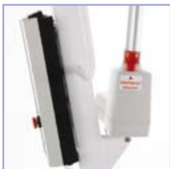
Linak battery & actuator