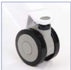
75mm low profile castors

The Oxford Major 190 is a true heavyweight contender and is the perfect cross over product for both nursing and institutional care. Its high lifting capacity (190 kgs) and lightweight design allow the Major to work well in almost all settings.