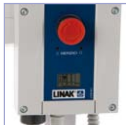
Control box with LCD display