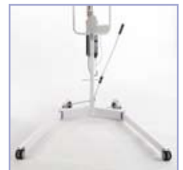
Legs open wide for stable and safe lift